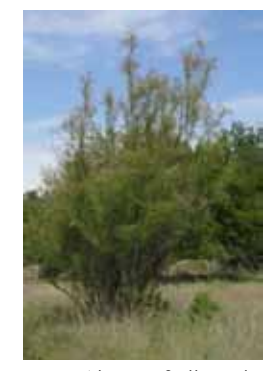
Above: Salt cedar Below: Japanese Knotweed