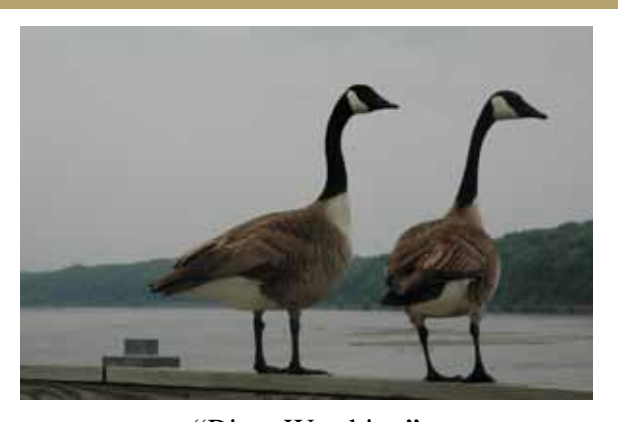
"River Watching"